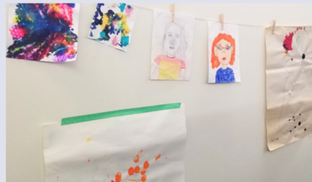
Kids Art Show Gala 2023